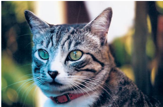
Our Featured Cat is Chester Osborn.

Chester has Feline Immunodeficiency Virus infection and diabetes; he was diagnosed with both conditions between 2000 and 2003. He is now about 18 years old and doing quite well.